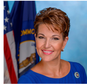
HEATHER FRENCH HENRY AMBASSADOR

FORMER MAJOR LEAGUE BASEBALL WORLD SERIES CHAMPION AND MEMBER OF THE NATIONAL BASEBALL HALL OF FAME