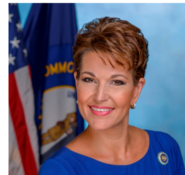
HEATHER FRENCH HENRY AMBASSADOR

FORMER MAJOR LEAGUE BASEBALL WORLD SERIES CHAMPION AND MEMBER OF THE NATIONAL BASEBALL HALL OF FAME