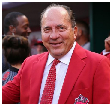
JOHNNY BENCH AMBASSADOR

U.S. ARMY VETERAN (IRAQ WAR), PURPLE HEART RECIPIENT, ACTOR, STUNTMAN, AND PHILANTHROPIST