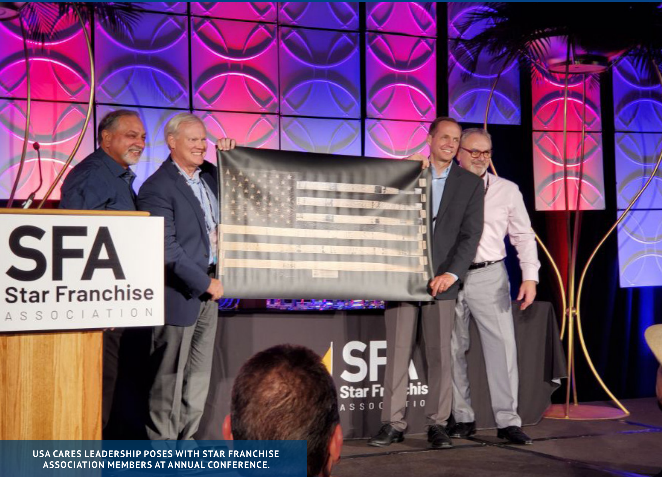
USA CARES LEADERSHIP POSES WITH STAR FRANCHISE ASSOCIATION MEMBERS AT ANNUAL CONFERENCE.